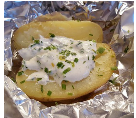
chart paper, marker, types of potatoes to eat (French fries, baked potatoes, hash browns), dipping sauces, toppings etc. (optional)

Preparation: Give notice to the chef. Gather ingredients.