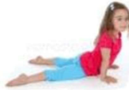
UPWARD FACING DOG