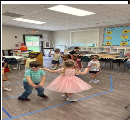
Pre K A Dancing TOGETHER and CELEBRATING "MUSICAL MONDAY"