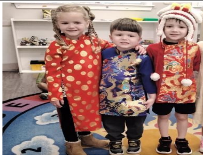
Look at my friends in suite 450 celebrating the Lunar New Year!

"The Sleep Book" Wear your cozy pajamas!