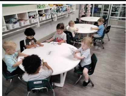
Suite 250 is coloring butterfly wings for create together.