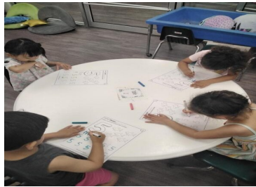
Suite 450 is learning to trace and color the number five.