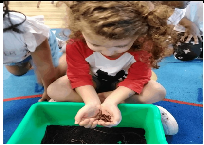
Exploring wiggly earth worms.