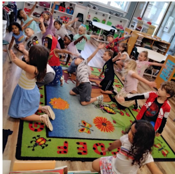
Pre-K using their frontal lobe when doing their exercises and stretching.