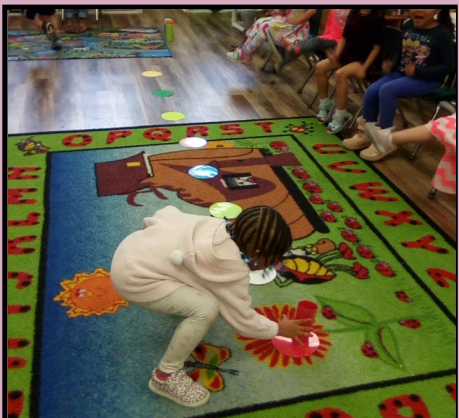
Matching color race for a rainy day activity.