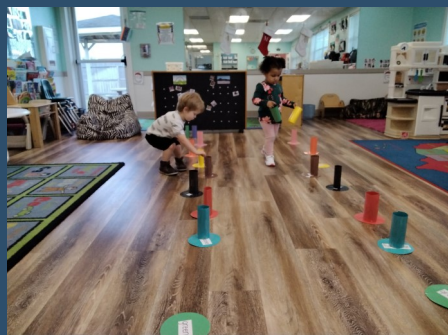
Kaysin and Tatum doing an amazing job playing the matching color game!