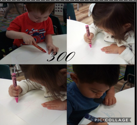
Our class creating a picture of a funny face.